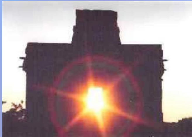
Siete Muñecas Dzibilchaltún, Yucatán

8. Dzibilchaltún an archeological site and Museum of the Mayan Pueblo are located just North of Mérida. Tour includes optional swimming in a cenote . Progreso is a small, but extremely diverse Gulf port town just North of Mérida. It is a major trans-Gulf port for commercial trade with the USA. The tour includes time for lunch and swimming in the Gulf of Mexico. This tour can be done together or in two separate days. Host families provide lunch boxes but students have the option to eat in a restaurant. meal ranges from US$8.00 - US$12.00 / person.