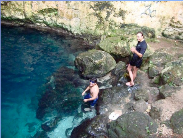
Cenote Chelentun Cuzama, Yucatán

7. Cuzuma: Three Cenotes IMPORTANT: Cenotes are very deep—swim at your own risk. This adventure excursion departs the Institute of Modern Spanish at 1:00PM for a 2:30PM arrival at Cuzuma. Along the way to Cuzuma, there are several photo opportunities as we pass through small villages with haciendas and churches. Upon arrival to the remote village of Cuzuma, students take a seven kilometer rail trip into the jungle via horse-drawn platform buggies. There are stops at three cenotes: Chelentun (Laying Doan Rock), Chansinic'che (tree with small ants), and Bolonchoojol (nine drops of water). This excursion is rather "rustic" with limited availability for changing clothes—please leave the institute prepared to swim. NOTE: There is no meal included on this trip. Therefore, we recommend that you ask your host family to prepare a sandwich for you to take along. Please let them know one day prior.