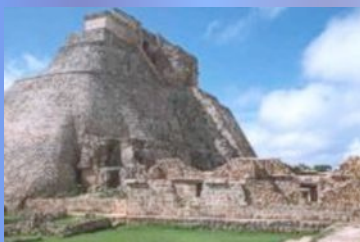
Castle of the Magician Uxmal, Yucatán

Included with a walking tour is to visit the monastery and church made famous during the colonial times as the head of the Catholic church in Yucatan. The Pope visited this city in 1986 and attracted hundreds of thousands of people. The entire city of Izamal is painted egg-yolk yellow—the holy color for the Mayan people. Includes transportation and bilingual guide.