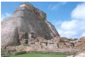
Castle of the Magician Uxmal, Yucatán

Included with a walking tour is to visit the monastery and church made famous during the colonial times as the head of the Catholic church in Yucatan. The Pope visited this city in 1986 and attracted hundreds of thousands of people. The entire city of Izamal is painted egg-yolk yellow—the holy color for the Mayan people. Includes transportation and bilingual guide.